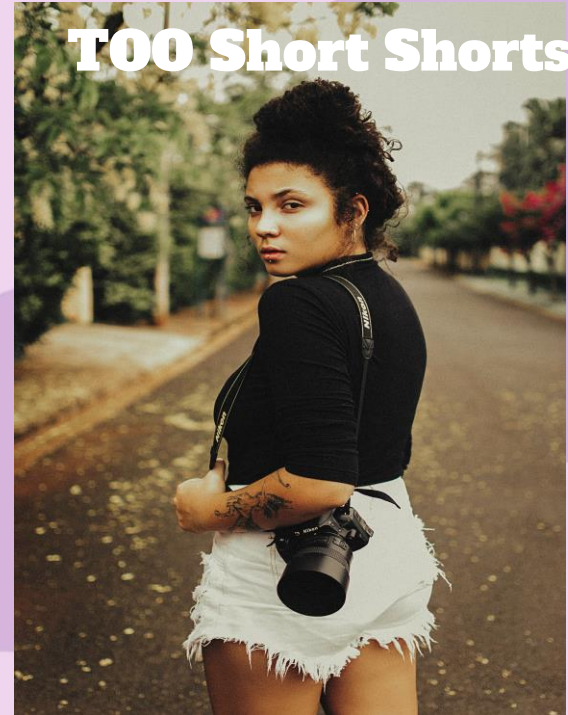
TOO Short Shorts