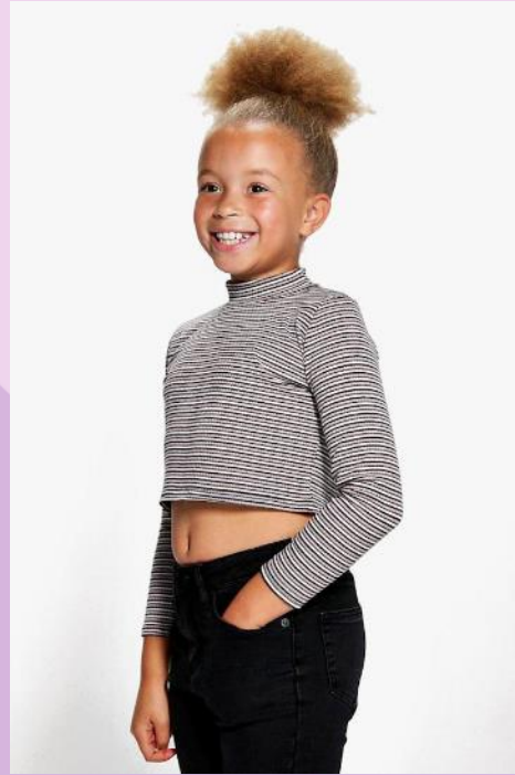
Midriff or navel showing