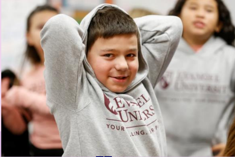
Hats or Hoods on Head