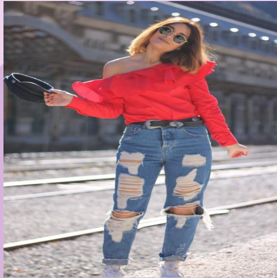
Ripped Jeans Above the Knee