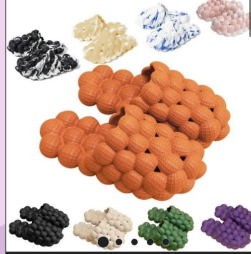
Bubble Shoes or Slippers